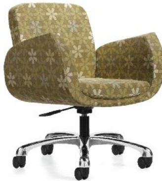
2811-8 Medium Back Swivel